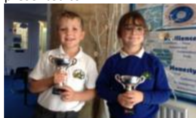
Charlie showing respect by being polite and Tiger for showing respect.