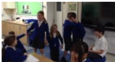
Creating a tableau to help our writing.

In Silver Birch we have been learning about the early stages of WW2, in particular evacuation and the Blitz. We have written letters home from evacuees – sharing our experience with our parents and family in London. We have also focused on the attack on Coventry in 1940 – the worst example of a Luftwaffe air raid. We are writing news reports in the style of the BBC radio reports – thinking about the formal language used and how audiences were informed about these events.