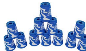
equipment to teach resilience