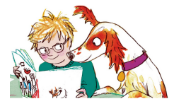
reading dog visits