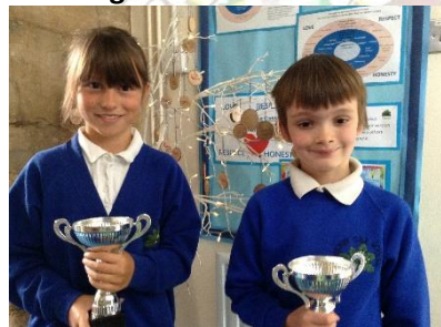
Amber for showing love and Tristram for showing respect.